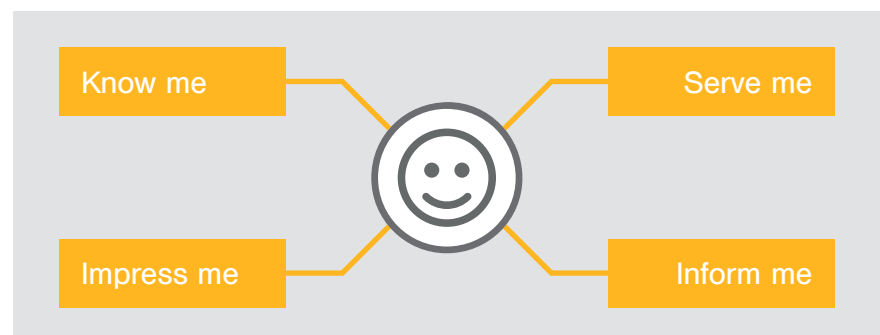
Enhancement of travel expectations

app provides its users with a dedicated customer experience dependent on their current status, e.g., service request functionalities, a mobile key card solution, entertainment or room control functionalities, to enhance their on-premise service or "digitally smart" hotel rooms. Whether a guest is still at home (about to book), on their way to the hotel or already checked in, choosing add-ons and activities for the stay – Velimo enhances the guest experience by offering a content-aware application that gives them what they need, when they need it.